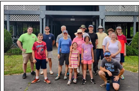
Members of the village's Parks Committee on June 27 performed a clean-up at Island Park. With help from employees of American Steamship, volunteers power washed some of the large pavilion and painted benches and tables as well as removed weeds from the flower beds.