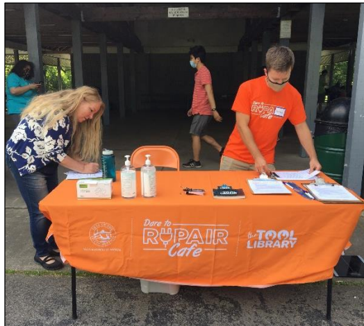
FIX IT: During the village's Earth Day celebration at Island Park, volunteers for the Dare to Repair Café fixed items at no cost to people who registered in advance. Repairs included sewing and light electrical repair (above left and right, respectively). The Earth Day event was hosted by the village's Environmental Advisory Committee.