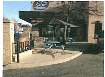
The above represents seating that is removed from the parking facility by a minimum 6" elevation, but lacks the necessary railing.

(6) A plan showing the complete sidewalk and/or dining area, the location of all furniture and fixtures to be used, including a seating plan, and the location of any entrances and/or exits.