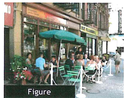
The outdoor seating pictured above, lacks aesthetic quality and features inappropriate barriers to vehicles.

shall review such application for consistency with the standards set forth herein, and either grant, grant conditionally, or deny such application.