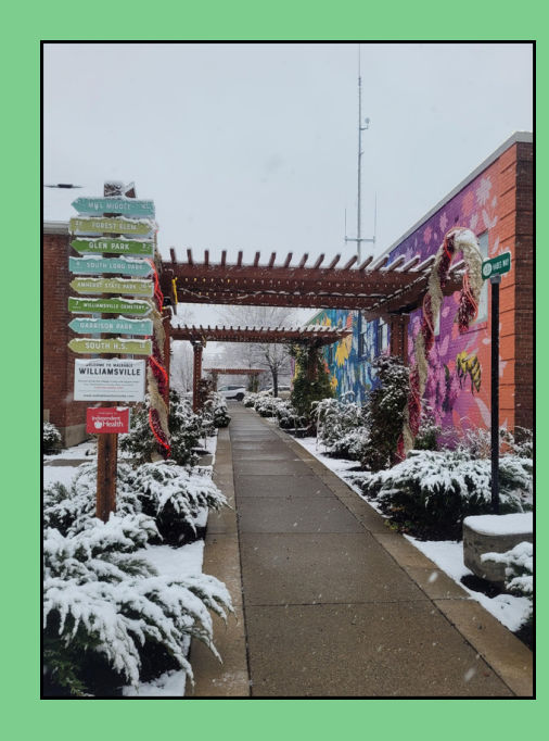
All images either submitted by Williamsville residents or photographed by village officials. December 2020