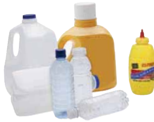
Jugs & Bottles with Small Top Openings