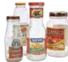
Clear Bottles & Jars