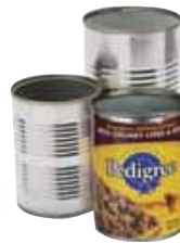
Steel & Tin Cans