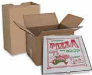
Cardboard & Pizza Boxes Flatten cardboard. Remove wax paper from pizza boxes