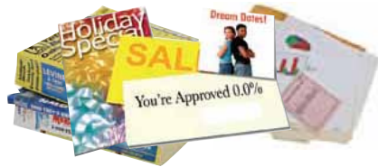
Office Paper, Phone Books Paperbags & Junk Mail