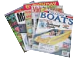
Magazines & Catalogs